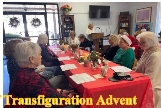
Women of Transfiguration Advent Tea Prayer

Dear Jesus, we turn to You in the time of illness. O dearest Comforter alleviate our worry with your gentle love. We place our sick under Your care and humbly ask that You restore Your servants to health again. Above all, grant us the grace to acknowledge whatsoever you do, you do for the love of us.