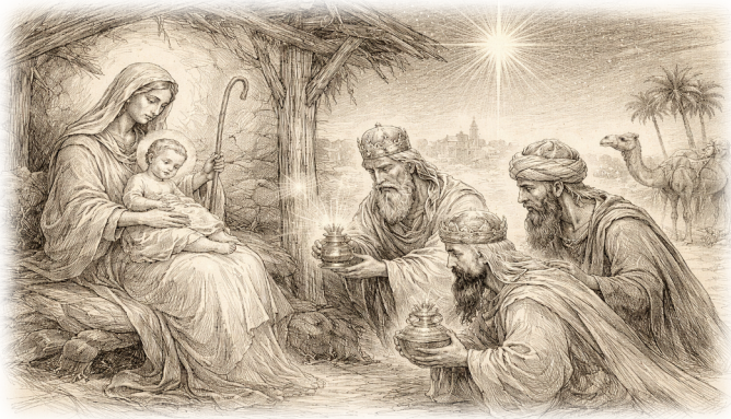
Feast of the Epiphany of the Lord January 4, 2026