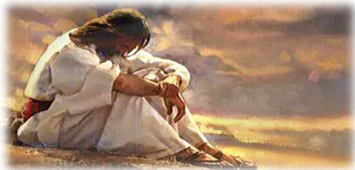
First Sunday of Lent March 9, 2025