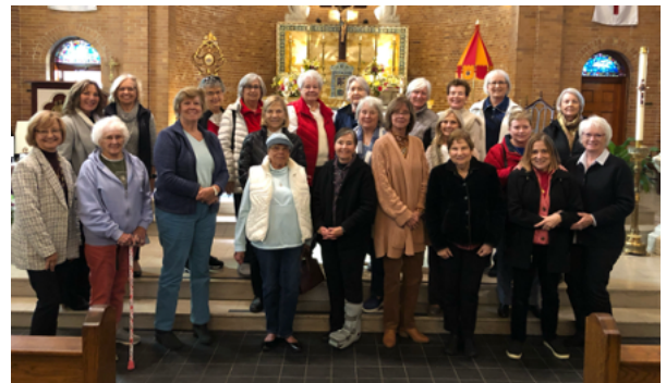
Women of Transfiguration visit to the Basilica of Saint Mary in Wilmington