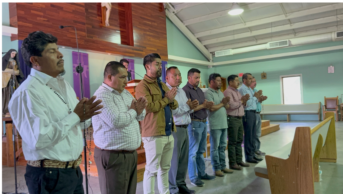
3 rd Degree Exemplification of Knights of Columbus from Transfiguration and Santa Clara