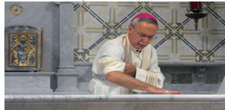
Dedication and Blessing of the New Altar

Mark your calendar: June 2, 2026 at 6:30 PM